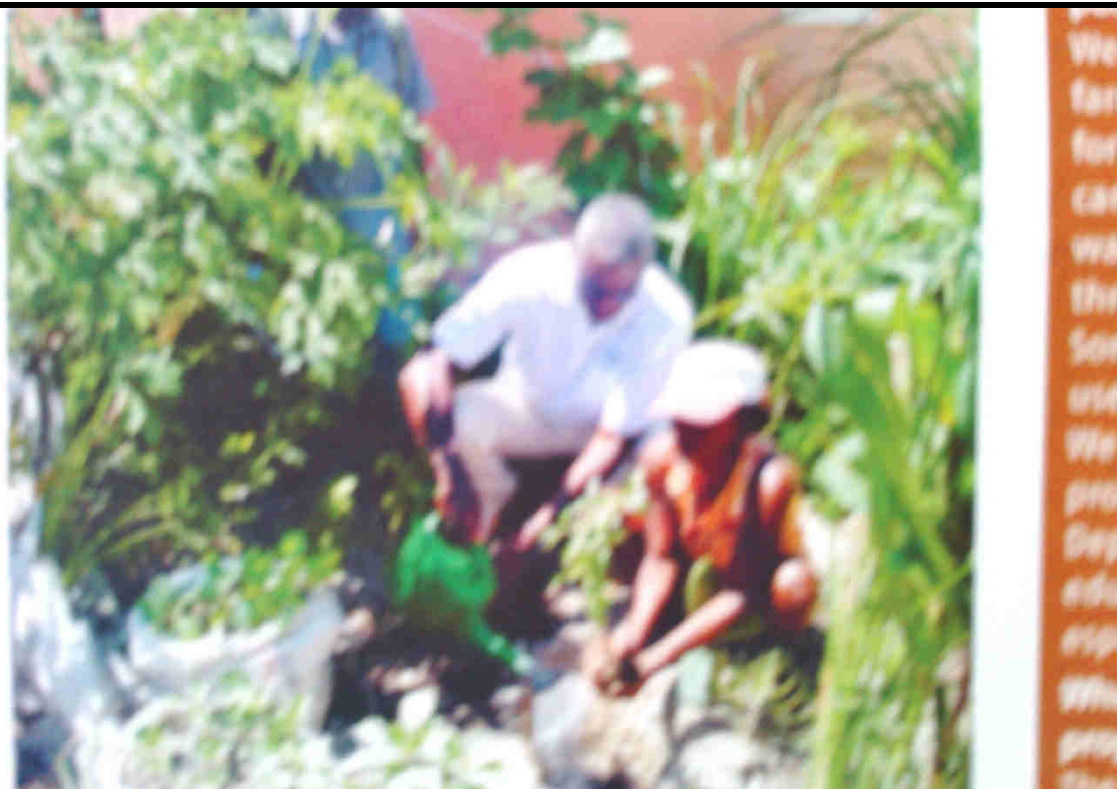
Plate 2: A micro-garden in Haiti