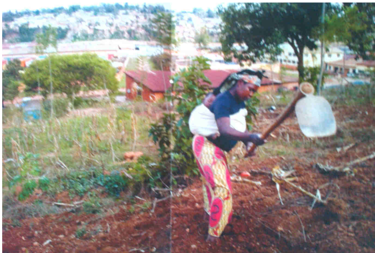
Plate 1: A woman cultivating backyard farm to improve household food security in Kigali, Rwanda

gardens of the poor farmers. The report concluded that leafy green vegetables are part of the diets of many households across Africa. They are used primarily to accompany starchy staples like rice, "fufu" pounded yam and "garri". Rapid urbanization in recent years has led to traditional leafy vegetables being replaced by species of Brassica including cabbage, kale and mustard (Spore, 2004; FAO, 2001). The Food and Agriculture Organization is promoting integrated production of vegetables among households in flood-hit areas of northern Uganda. Women are learning how to grow Brassica and solanacea vegetables in sacks packed with stones, fertilizer and earth. They lift the jute sacks onto stones to allow aeration and proper drainage. Vegetables grown in this way can easily be moved to protected areas away from floods and plant diseases. According to the report, the sack vegetables are proving popular in cities like Arapai, Asuret, Kadungulu, Pingire and Tubu in northern Uganda (FAO, 2001; Spore, 2005).