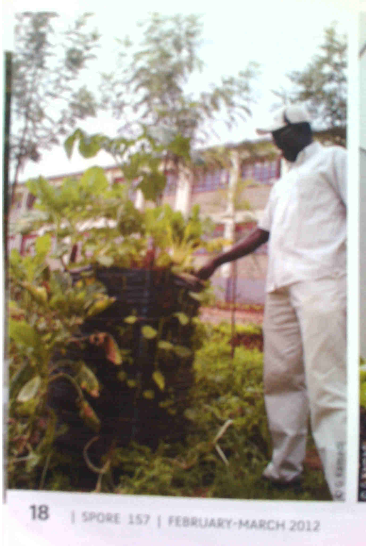
Plate 3: Sack gardening in a Kenyan suburb.