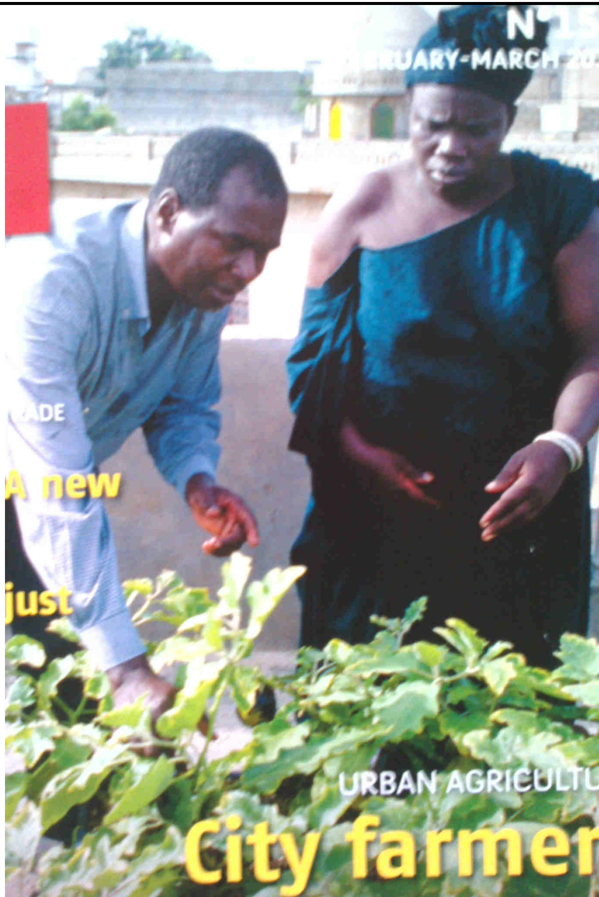
Plate 5: Urban Agriculture in Mali. Source: Spore (2012)